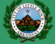
2013-2015 BOND AND SALES TAX PROJECTS 2014 YEAR END - WARD 5